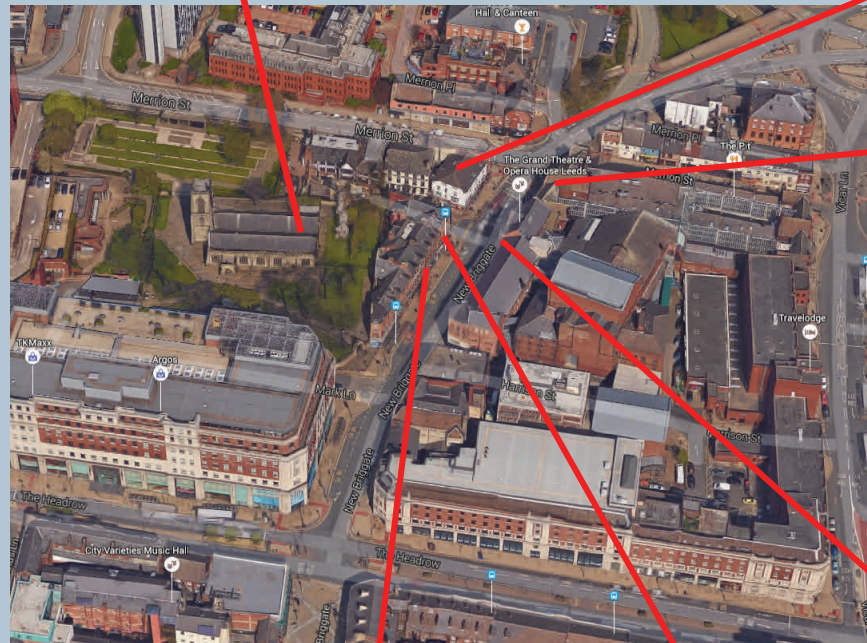
Grand Arcade, 1897, Grade II listed. Substantial recent investment by owners and occupiers has recognised the importance of the special character and quality of the building