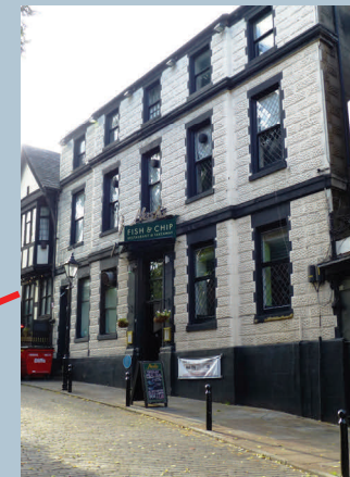
Mathew Wilson's House of 1720, Grade II listed. The only surviving residential house from the first accurate map of Leeds by John Coussins of c1726. Now Nashes Fish & Chip Restaurant