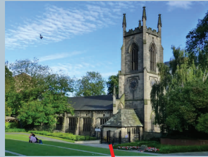
St John's church (Grade I listed, 1634) the oldest surviving place of worship in the city centre. Together with the Memorial Gardens at Merrion Street provides important city centre green space

Positive unlisted 19th century buildings offer enhancement opportunities. Shopfronts, signage, maintenance issues and underused upper floor space are all targets of the TH regeneration scheme