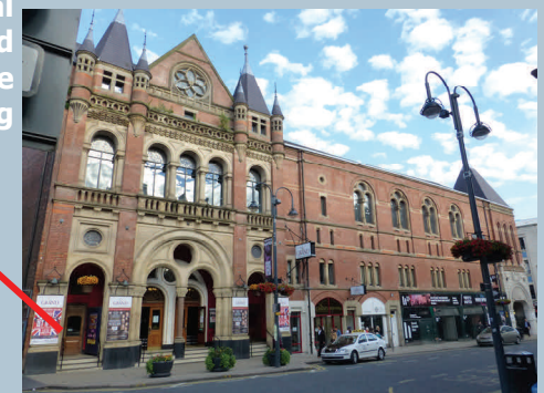
Grand Theatre and Assembly Rooms, Grade II* listed. Strategic aim to improve the setting the street offers to this important cultural asset of the night time economy